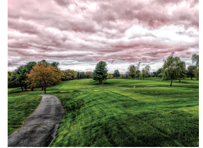
Exhibit ends May 31, 2024.

This open-themed extravaganza features the very best artwork from BVAA's diverse membership. They explore black and white photography, landscapes, watercolors, acrylics, oil paintings, and much, much more.